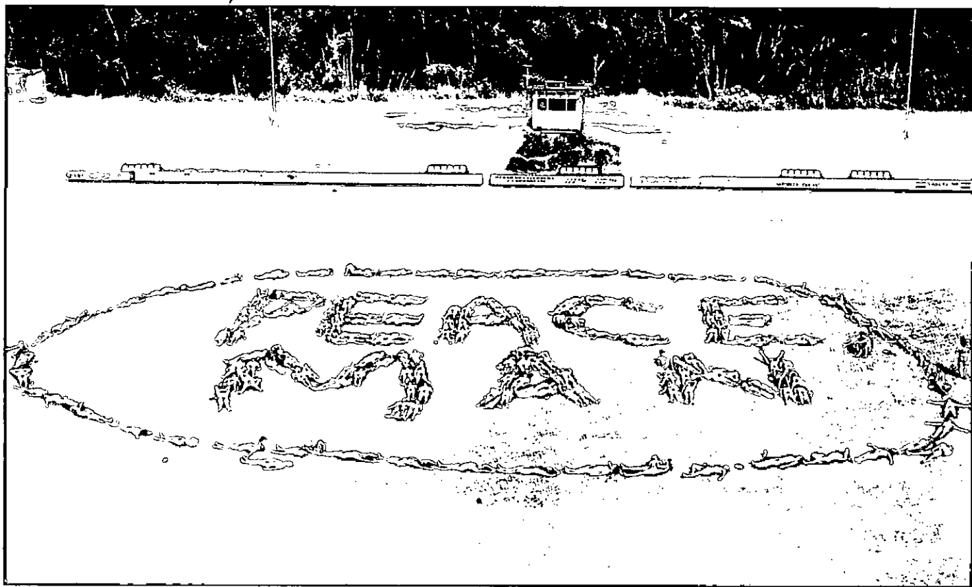
Around 250 men bared all in Byron Bay at the weekend in an anti-war protest.